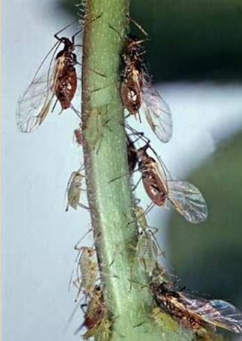
Rose Aphids ( Macrosiphum rosae ) Ref: www.britannica.com

More than 4,000 species of aphids have been described world-wide, with over 1,300 species occurring in North America. At least 250 aphid species are important pests of crops and ornamental plants.