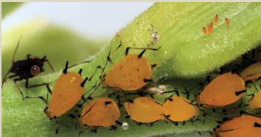
Oleander aphid ( Aphis nerii ). Ref: http://www.britannica.com

Another common aphid is the yellow oleander aphid, Aphis nerii also known as the milkweed aphid. It will infest plants in the families Apocynaceae and Asclepiadaceae . This bright yellow aphid with the distinct black appendages is commonly found feeding on oleander ( Nerium oleander ), milkweeds, such as pine leaf milkweed ( Asclepias linaria ) butterflyweed ( Asclepias tuberosa ), and scarlet milkweed, ( Asclepias curassavica ), and wax plant ( Hoya carnosa ).